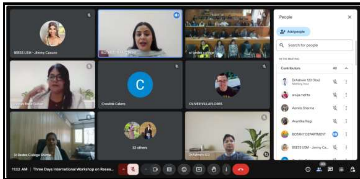
Three Days International Workshop on Research Methodology (Online) (7 - 9 April, 2025)