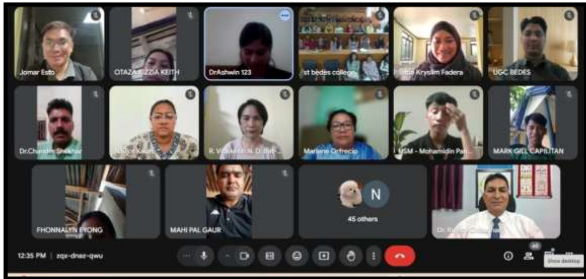
Three Days International Workshop on Research Methodology (Online) (7 - 9 April, 2025)